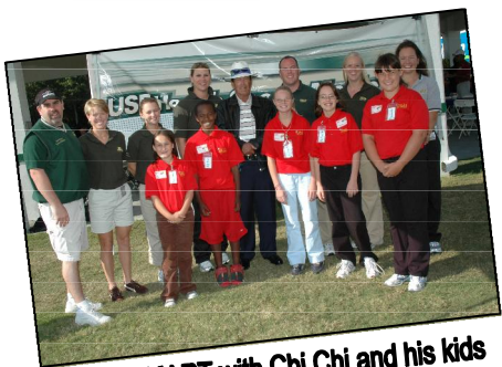
USF SMART with Chi Chi and his kids