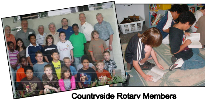
Countryside Rotary Members with the 4th Grade Students

Thank you to The Rotary Club of Countryside: Rotary members donated 78 personal Webster dictionaries to our Academy students as part of a national Rotary education project. The kids were excited about having their very own book and the teachers report that students have enjoyed spending time looking up words and having fun with the geography maps in the dictionaries.