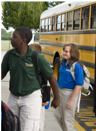
School began Monday, August 19th at Chi Chi's with a full bus schedule.