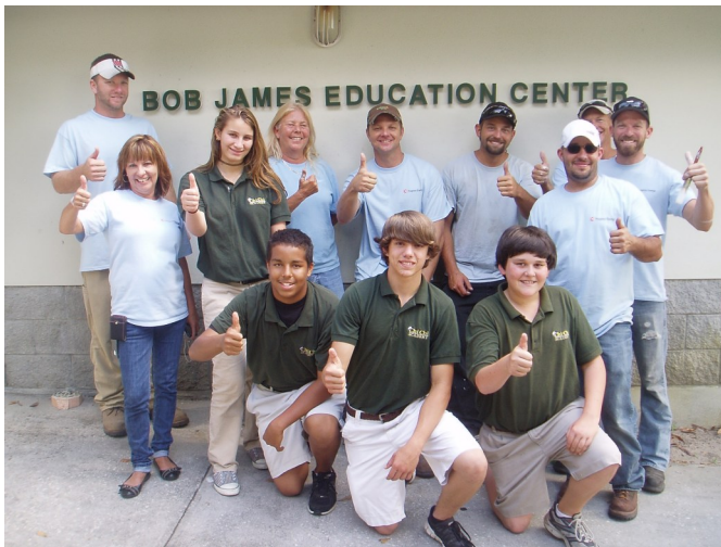
Progress Energy Volunteer Painters meet some of the Chi Chi Students.