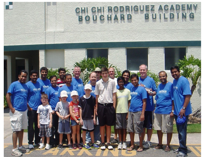
Nielsen Volunteer Painters with The First Tee Summer Campers

Bob James Education Center and Jack’s Place on Chi Chi’s campus received a fresh coat of paint: Thanks to Progress Energy and Nielsen volunteers, Chi Chi’s students have a brighter look to their school areas. Progress Energy volunteers undertook painting the Bob James Education Center and Nielsen’s volunteers tackled Jack’s Place in the Nicklaus Family Center. When the students return in the fall the freshly painted walls will be a nice surprise. Thank you Progress Energy and Nielsen.