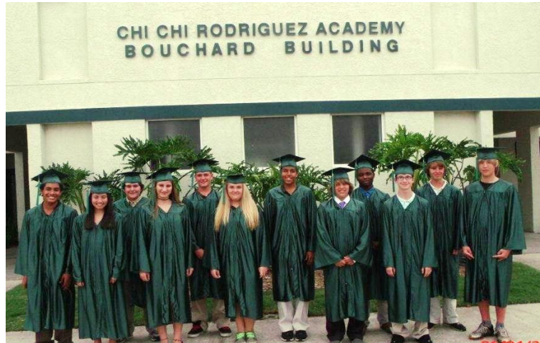
Chi Chi Graduates in their new cap and gown