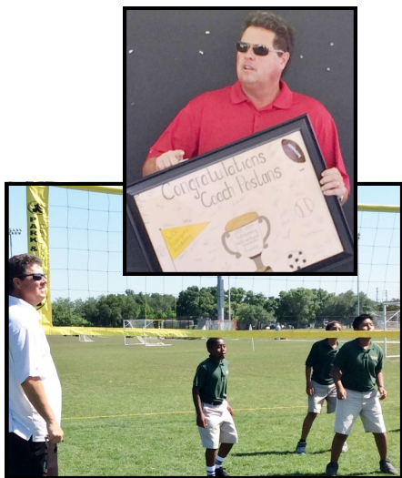
Top: Coach receives Award from students; Bottom: students play volleyball as Coach referees during P.E. class