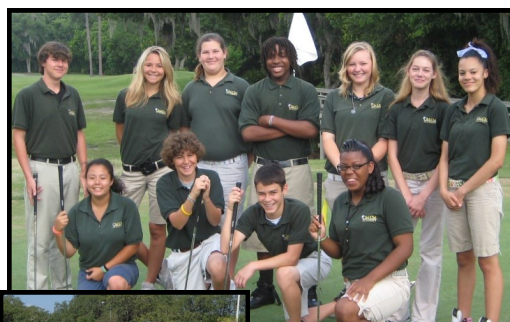
Top: 2014 high school Graduates during 7th grade

The first class of graduates who entered Chi Chi’s following our expansion in 2007 from two to five grade levels have graduated high school. Of this original class of fourteen, nine students remained in the Pinellas County School System through high school. Eight of nine students graduated with a C+ or better grade point average, giving Chi Chi’s an 88% high school graduation rate. In comparison, Pinellas County averages a 72% graduation rate. The Academy is grateful to staff and donors who supported and believed in these students early on. The learning tools and academic preparation they received at Chi Chi’s made a big difference!