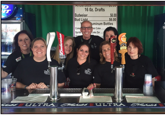
Leadership Pinellas at the 19th Hole Michelob Ultra tent during the Valspar Championship