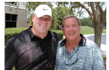
Tampa Bay Buc's Defense Captain Chris Hovan and Professional Golfer Fuzzy Zoeller at the 2009 Invitational

Chi Chi Invitational at the Bayou Club in Largo: The 3rd annual event is coming up on Saturday, June 5th. Sponsorships start at $2,500 per individual and includes golf plus dinner. All proceeds benefit the Academy's annual program fund.