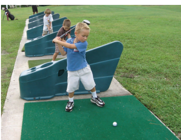
2009 Summer Campers practice at Sports Complex

The five Promises: caring adults, safe places, healthy start, effective education, opportunities to help others.