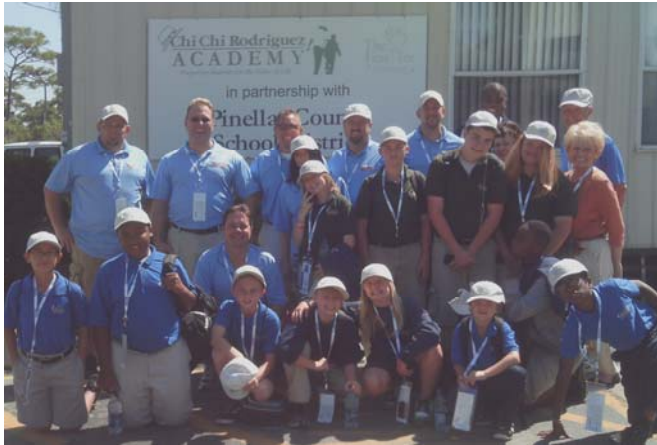
Volunteers from Bimbo Bakeries buddy up with Academy Students for the Transitions Championship at Innisbrook compliments of Raymond James