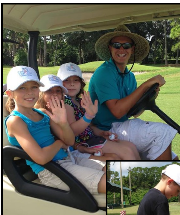
The First Tee of Clearwater Participants during Summer Camp