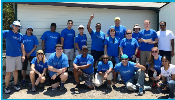
Top Left: Volunteers painting the main maintenance building; Top Right: Volunteers on the course painting hole signs; Bottom: The whole group posing for an after photo Right: The new equipment washpad and chemical shed

The Foundation is hard at work making capital improvements, with the mission to provide a unique learning environment that's safe for our students. This May, over 30 volunteers from Nielsen in Oldsmar came to work at Chi Chi's for Nielsen Global Impact Day! Projects included painting all Grounds Maintenance buildings, the new sand bin, course hole signs and tee box markers. This day completed the major renovations at the Grounds Maintenance area, including a new equipment wash pad, chemical shed, landscaping and building repairs. Students took time to meet the volunteers and see the valuable lesson in giving back to your community.